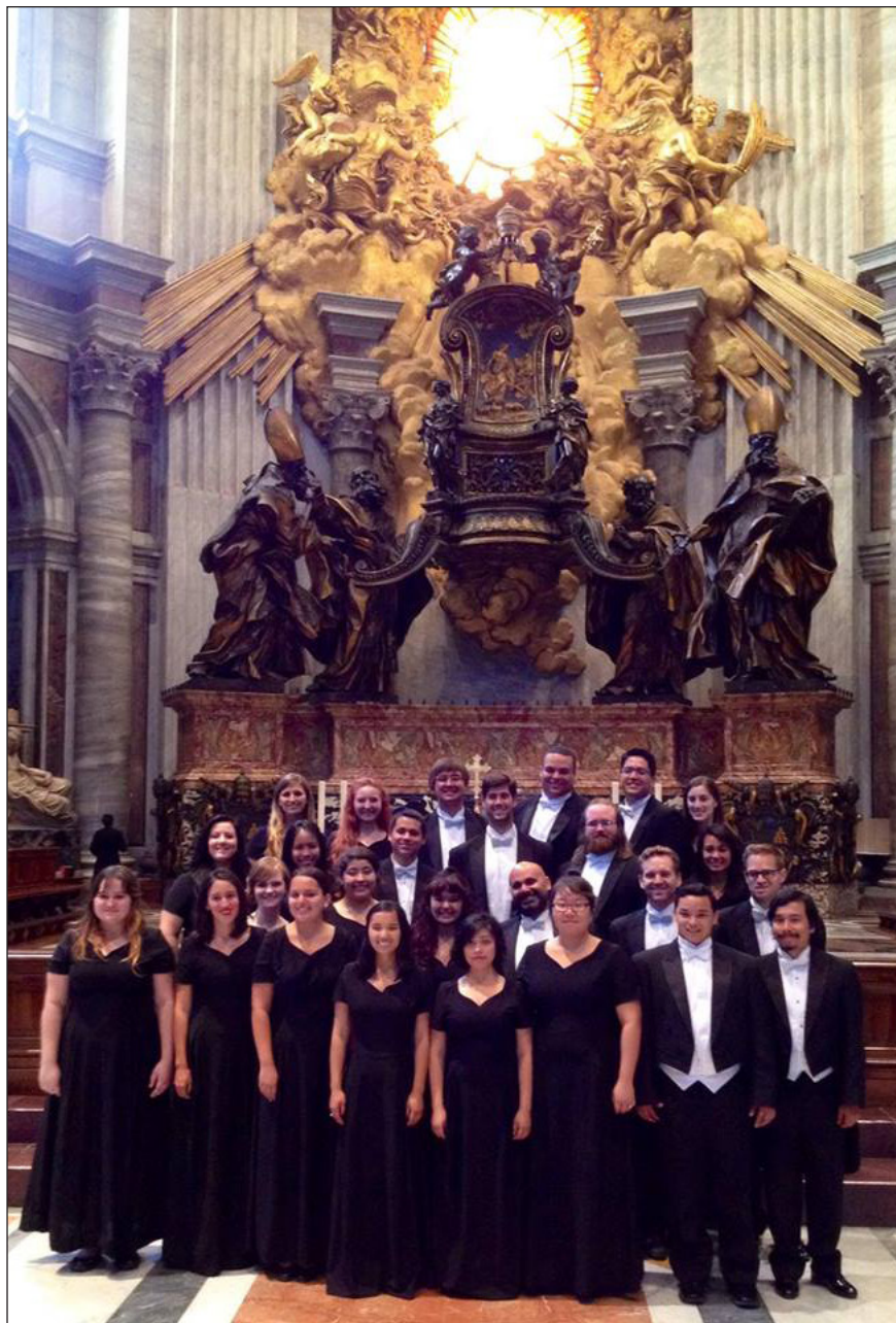
2014 European Choral Tour